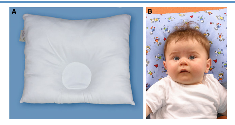
Figure 1. A, The BabyDorm bedding pillow. B, Use of the bedding pillow.

Using an additional covariance analysis to adjust the groups for baseline differences regarding severity of cranial